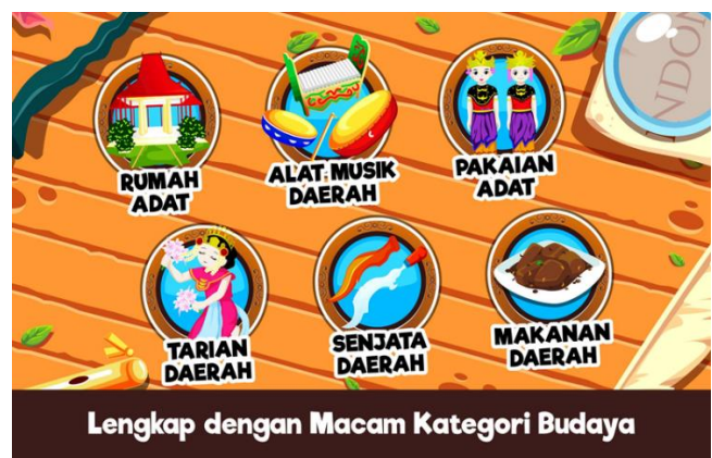
Figure 2. Main Menu Education Game

Positioning the right brand in various ways, such as placing the position of a product in detail and more specifically for the customers. Building and developing positioning is putting all aspects of brand value as a part of the functional benefits that are consistently applied. The purpose is to make brands always become number one in the minds of consumers, especially customers. In this study, the position created is the position on the perceptions of consumers where products are for children, with brand value as an educational tool packed in e-learning games by getting to know Indonesian culture in a fun way (see Figure 2).