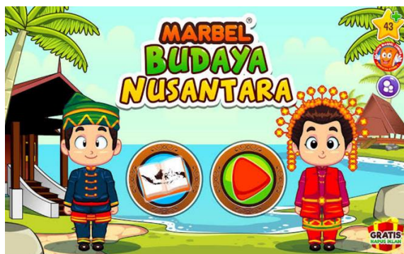
Figure 4. Cover of Education Game

In the final stage of the branding process that must be prepared to communicate the brand value and the right positioning to consumers, which must be supported by the existence of the right concept. The development of concepts designed for a brand is a process that requires creativity because it is different from just positioning, the concept can continually change because of its dynamic nature that conforms to the renewal of the product that the customer wants to instill. A good concept has an implementation to communicate the elements of brand value and the right positioning so that the brand image can be improved continuously (see Figure 4).