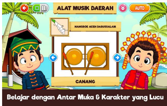
Figure 3. Educational game content.