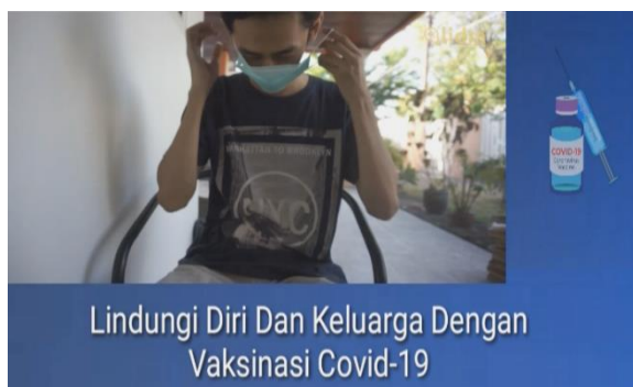
Figure 3. Squeeze Frame of Public Service Advertisement to Conduct The Covid 19 Vaccination

The information on Squeeze Frame is contain advanced to the community to conduct the Covid 19 vaccination.