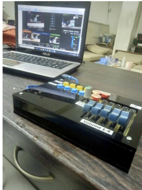
Figure 4. The process of Vmix Console

age 20 – 25 years old. Table 1 shows the results on the USE Questionnaire that the console runs well and is user friendly for all users. We conduct the USE Questionnaire three times a week to test the reliability of this console.