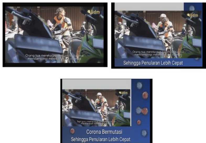
Figure 5. The result of video squeeze frame

On the squeeze frame, we show a video of public service advertisements related to covid vaccination so that it can increase public awareness to vaccinate. The result of video squeeze frame are shown in figure 5.