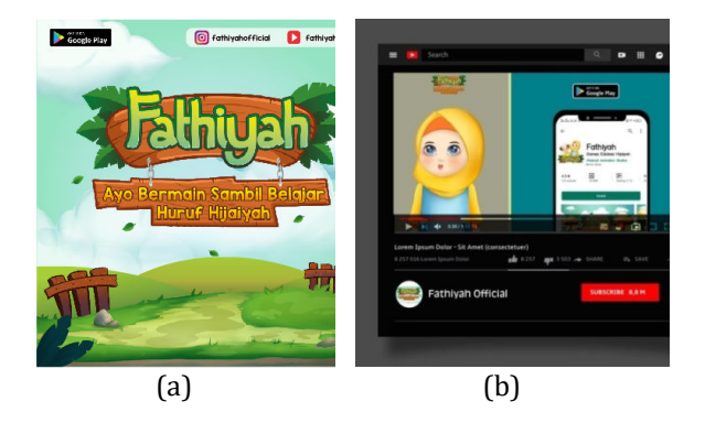
Figure 13. Digital media (a) web banner (b) motion graphic