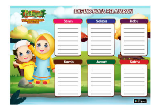
Figure 11. Subject poster