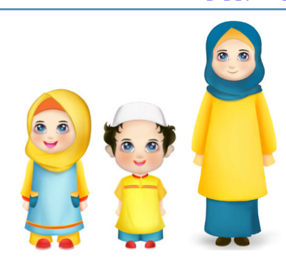
Figure 6. Characters on the Fathiyah app

The character display in the "Fathiya" application consists of three characters, brother, sister and mother who use Muslims, the character becomes a strength in the application whose target audience is children and Kindergarten students, can be seen in Figure 6.