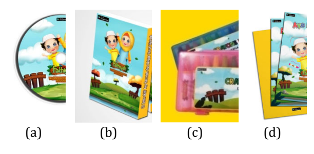
Figure 10. Support media (a) Compact disk, (b) CD cover, (c) crayon, (d) coloring book

After the main media, visual communication media will be developed as a means of supporting learning and strategies in promoting the Fathiyah brand or application brand. Apart from being a means of brand identification, supporting media are also designed as media or promotional tools in conveying a message, to get visual attention so that the message conveyed is easy for children to remember [19][20. All supporting media consist of the images shown in Figures 10,11,12,13 and 14.