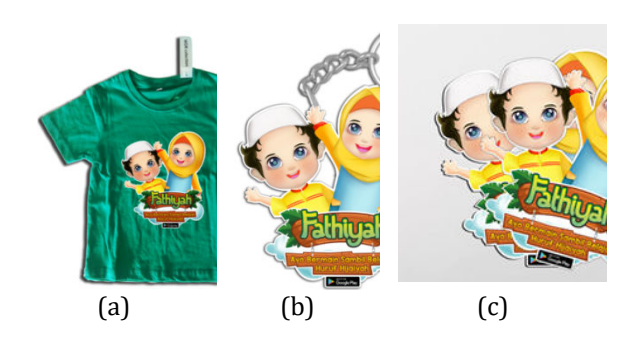
Figure 14. Merchandise (a) t-shirt (b) keychan, (c) sticker