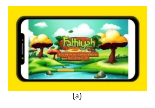
Figure 9. App view (a) smartphone, (b) laptop

user interface design on smartphones and computers is shown in Figure 9.