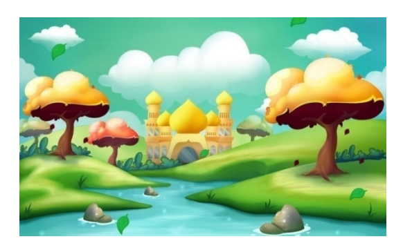
Figure 8. Coloring Background

This design produces an android-based Fathiyah application and interactive multimedia. This media serves as an alternative means of learning interesting hijaiyah letters, carrying the concept of playing and learning, so that children will be interested and become effective learning media in the face of the Covid-19 condition. The user interface itself is (interface design) as one of the factors to increase visits to an application. The user interface is needed to see the extent of the effectiveness and a design [18]. At this stage, the