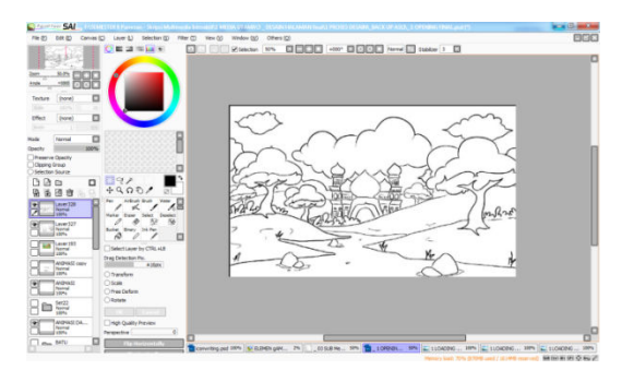
Figure 7. Sketch Background

The next stage is sketching the background using the PaintTool Sai design software, continuing the coloring process according to the visual concept of nature. It can be seen in Figures 7 and 8.