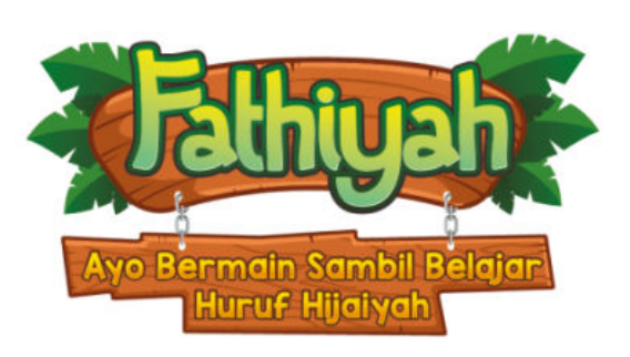
Figure 5. Brandname study

Brand name is an important factor that is very influential in developing brand awareness [17]. The brand name of this hijaiyah letter application uses the name Fathiyah as well as an identity that reflects the application, so that it is easy to remember, identify and differentiate from other products. The name Fathiyah was inspired by Surah Al-Fatihah in the Holy Quran, which is shown in Figure 5.