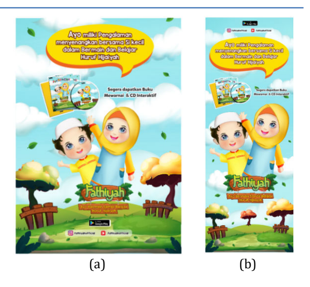
Figure 12. Promotionand information media design (a) poster, (b) banner