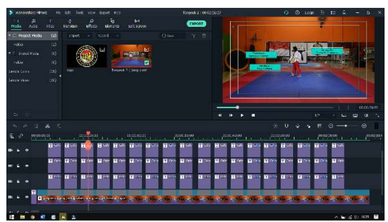
Figure 3. video merging process

The process of taking video on the storyboard is complete; next is merging the scene in the application. In addition to merging, sorting is done according to the storyboard according to the scenario flow.