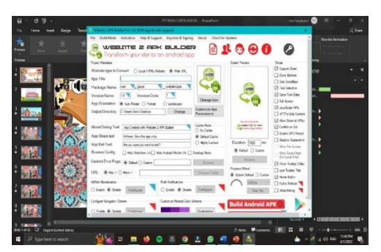
Figure 4. The process of making a digital storybook application