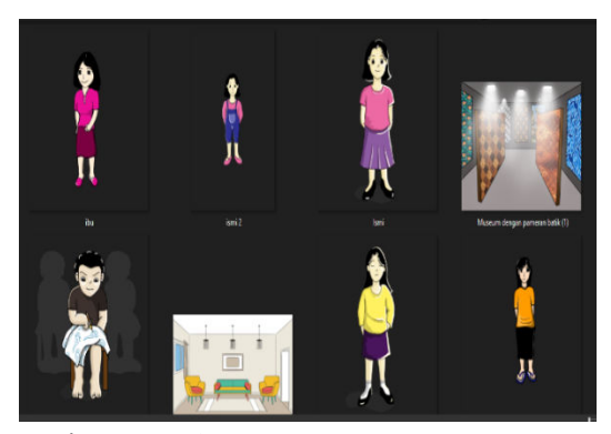
Figure 2 . Character creation in stories

After that, what is done is the creation of a digital storybook application using the Website 2 APK Builder Pro application.