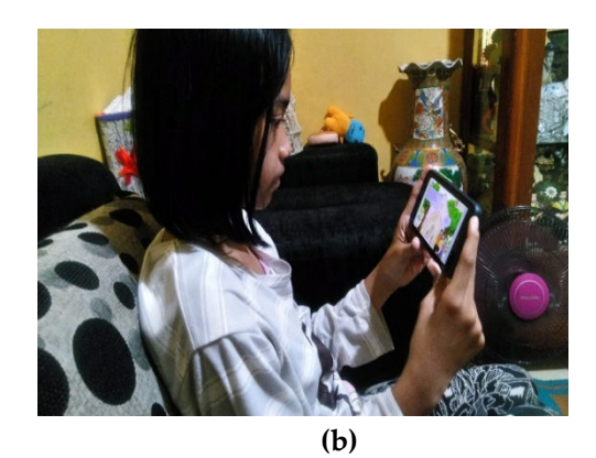
Figure 5 (a, b). A child is reading a digital love story book.

This digital story book really attracts the attention of early childhood because in the book there are charming pictures that can capture the child's heart and the colors that children like [19]. In addition, this digital storybook is convenient to carry and can be read at any time by children. Creative, communicative, and innovative story books can improve cognitive,