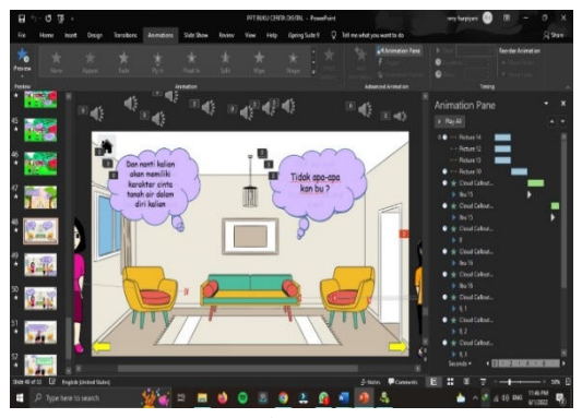
Figure 3. The process of making story books in the PPT application