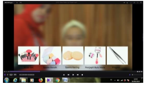
Figure 4. Display of various tools for black and white and color photo makeup in the video tutorial

The results of making a video tutorial produce a black and white photo makeup and color photo makeup. Black and white photo makeup tutorial videos and color photo makeup tutorials besides showing the working process of makeup, introduction to tools and materials are also shown in black and white and color photo makeup tutorial videos.