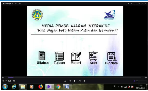
Figure 2. Display of interactive multimedia opening pages and titles

then proceed with the profile of the interactive multimedia makeup maker with black and white and color photos as shown in Figure 3.