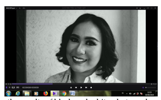
Figure 6. Display the results of black and white photo makeup in the video tutorial

The display above is a view when explaining the process of working black and white photo makeup. It is conducted by shooting video systematically and sequentially. The results of the black and white photo make-up can be seen in Figure 6.