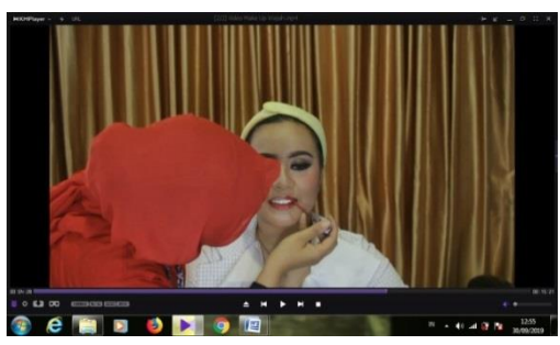
Figure 5. The appearance of giving lipstick on black and white photo makeup in the video tutorial

clarify. Furthermore, the video tutorial display explains the work process of various kinds of makeup, namely: the working process of black and white photo makeup, and color photo makeup.