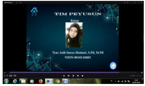
Figure 3 . Profile display of the head of the interactive multimedia composition team for black and white and color make-up photos

then proceed with the profile of the interactive multimedia makeup maker with black and white and color photos as shown in Figure 3.