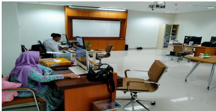
Figure 3. Plagiarism Test Service Room at Medan State University Library