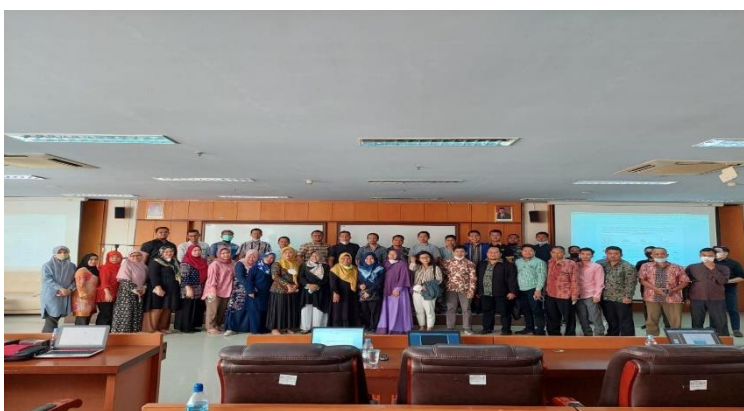
Figure 2. Plagiarism Team Formation and Training on the Operation of Plagiarism Tools

The existence of available facilities and infrastructure can achieve the goals and strategies carried out [17]. Facilities and infrastructure are tools to support the success of a process of effective use of turnitin software. The facilities and infrastructure provided by the Medan State University library are computers, internet networks and plagiarism test service staff who can assist students, lecturers and the academic community in checking plagiarism of scientific papers produced.